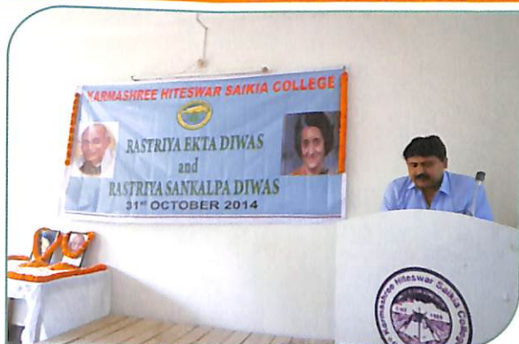
Asst. Prof. delivering lecture, 2014