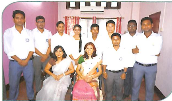
Students' Union of 2014-15

The oath-taking ceremony of the newly elected members of the Students' Union Body took place on 21st, Oct. 2014. The Principal and Vice-Principal administered the oath to the members in presence of teachers & students.