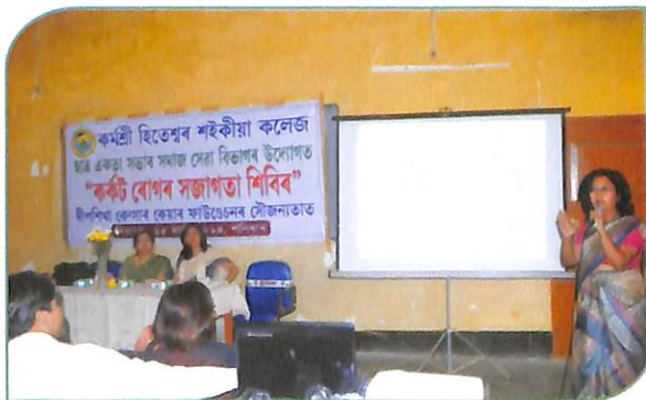
Workshop on Cancer Awareness

A Cancer Awareness Camp was organized by the Social Service Section of the Students' Union Body of