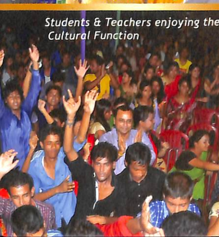
Students & Teachers enjoying the Cultural Function