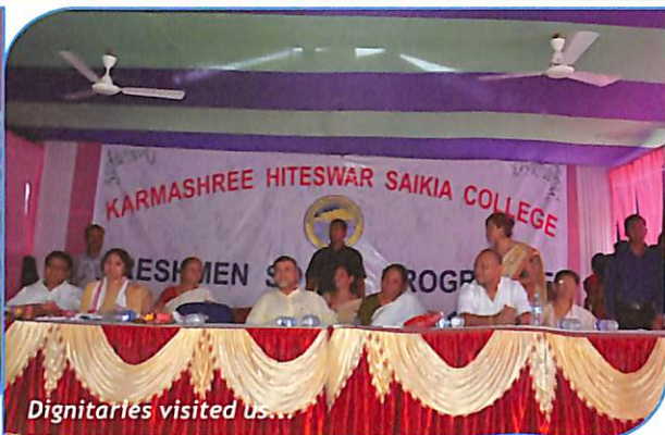
Dignitaries visited us...