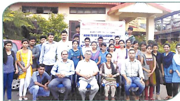
Participants on the lecture How to be ...