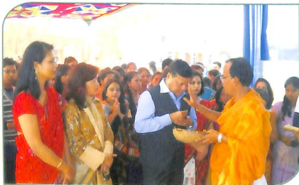
Guest offering paryer...