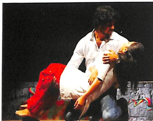
A scene from the play Romeo Juliet at Rabindra Bhawan