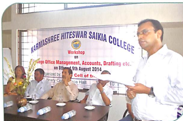
Workshop on the College...