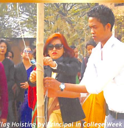
Flag Hoisting by Principal in College Week

Principal & Secretary, K.H.Saikia College.