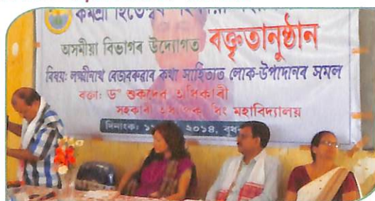
The lecture session in progress