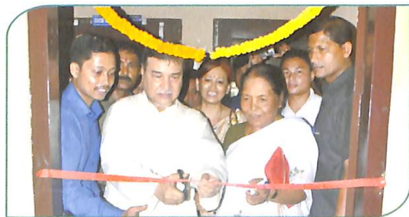
Sgt. Bhubaneswar Kalita Inaugurating....