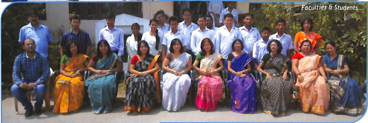
Faculties & Students...