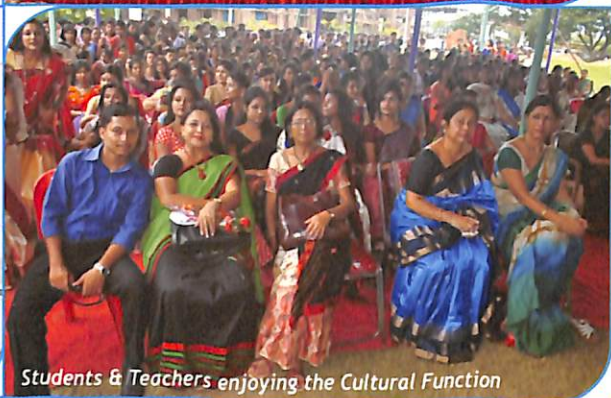
Students & Teachers enjoying the Cultural Function